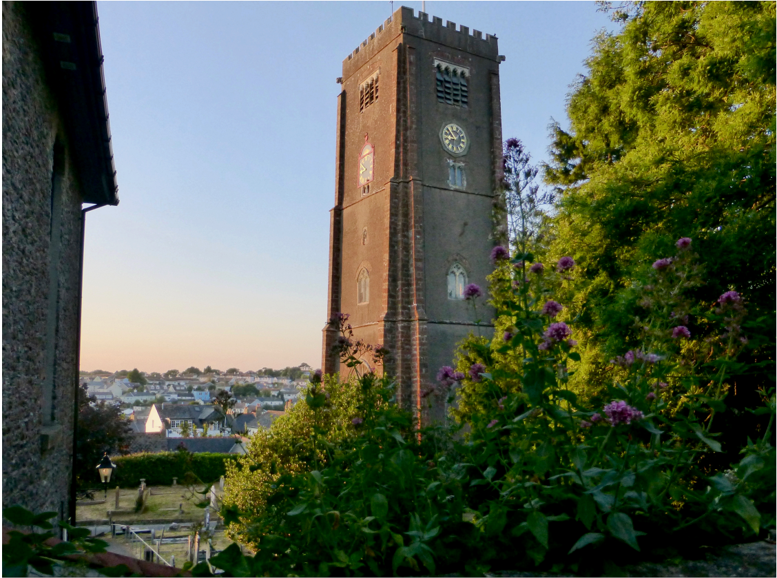
Saint Mary's Church