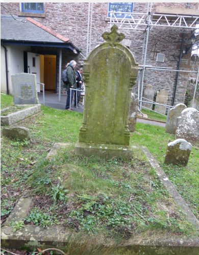
Plot 8 D33