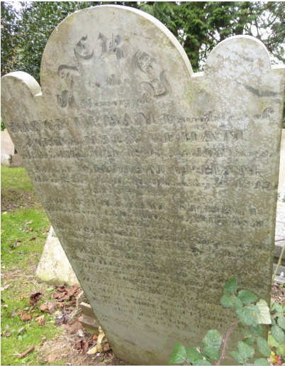
Plot 8 D27